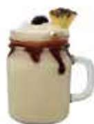
FROZEN PINA COLADA DON Q RUM, PINEAPPLE, COCONUT CREAM, CHERRY SWIRL