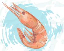
SHRIMP (HEAD ON) $16 / 10 PCS $30 / 20 PCS