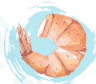
SHRIMP (HEADLESS) $14 / 10 PCS $21 / 20 PCS