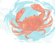
DUNGENESS CRAB $43 (1 3/4 LB WHOLE)