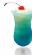
BLUE BAE GIN, VODKA, RUM, BLUE CURACAO, LIME, FROZEN MARGARITA