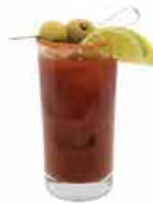
CAJUN BLOODY MARY VODKA, HOUSE CAJUN TOMATO BLEND, CAJUN SALT RIM