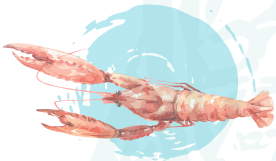
CRAWFISH $21 / LB