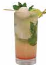
SAINT MOJITO RUM, ST. GERMAIN LYCHEE, MINT, LIME, GRENADINE