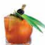
JUNGLE BIRD DARK RUM, CAMPARI, PINEAPPLE JUICE, LIME JUICE