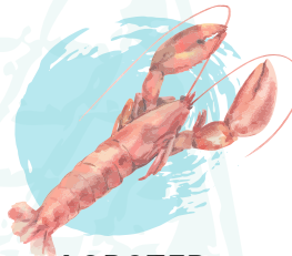
LOBSTER $36 (1 1/4 LB WHOLE)