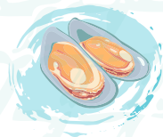
MUSSELS (NEW ZEALAND) $12 / 6 PCS $20 / 12 PCS