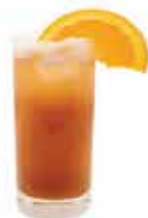
FRENCHMAN HENNESSY, CHAMBORD, GRAND MARNIER, PINEAPPLE