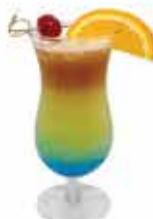
HENNESSY TRINITY HENNESSY, BLUE CURACAO, COCONUT RUM, PINEAPPLE, LIME