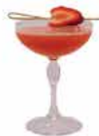
SIDEKICK ESPOLON REPOSADO, STRAWBERRY PUREE, TRIPLE SEC, LEMON JUICE