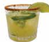
CHILLY MARGARITA INFUSED TEQUILA, COINTREAU, LIME JUICE, JALAPENO SUGAR