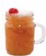
BAYOU JUICE MALIBU, CAPTAIN MORGAN AMARETTO, CRANBERRY, PINEAPPLE