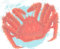
KING CRAB LEGS $80 / LB