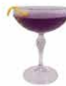
VIOLET'S HAZE VIOLETTE, GIN, LEMON JUICE