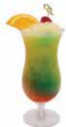
HURRICANE WHITE RUM, GOLD RUM, PASSION FRUIT PUREE, ORANGE JUICE, GRENADINE